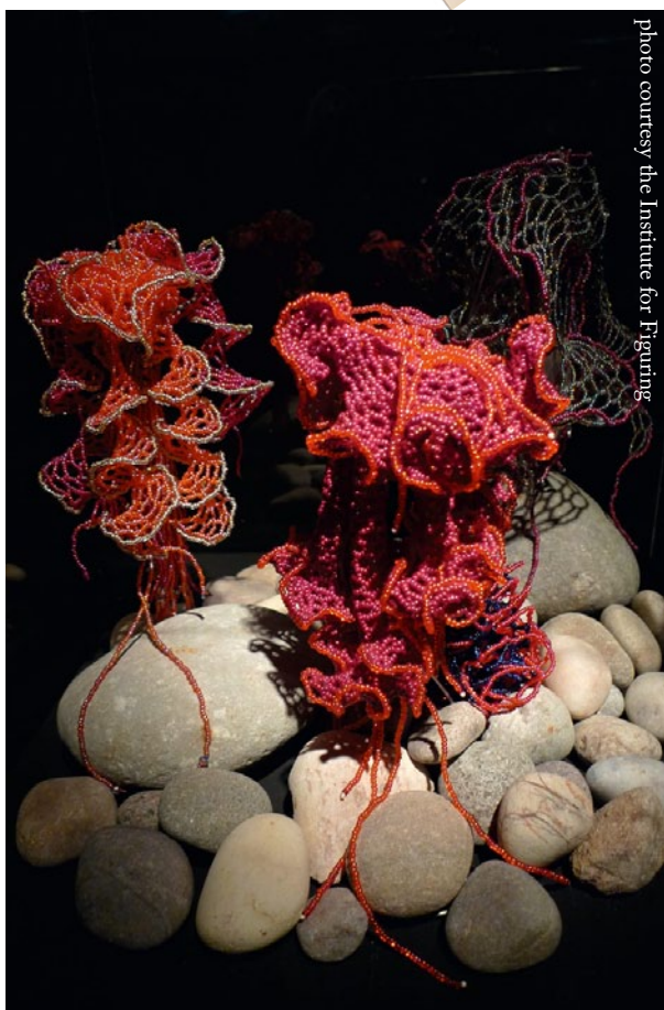
Beaded hyperbolic jellyfish