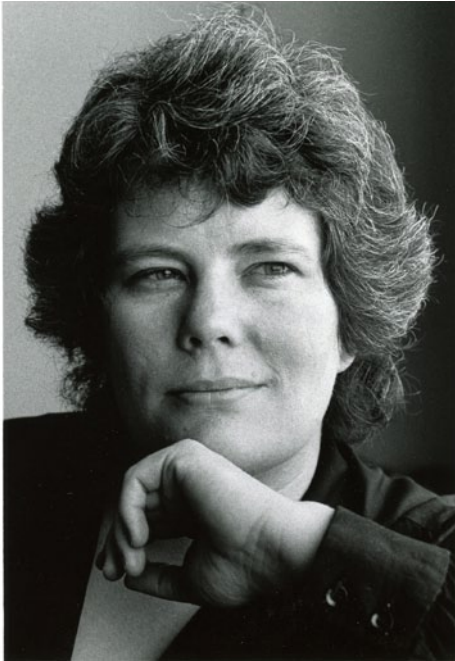
Vonda N. McIntyre, 1985